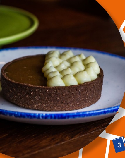
Flying Saucers at Yalm