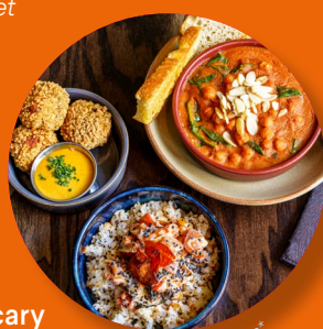
The Topsy Vegan