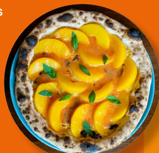
Eric's Pizza at Yalm