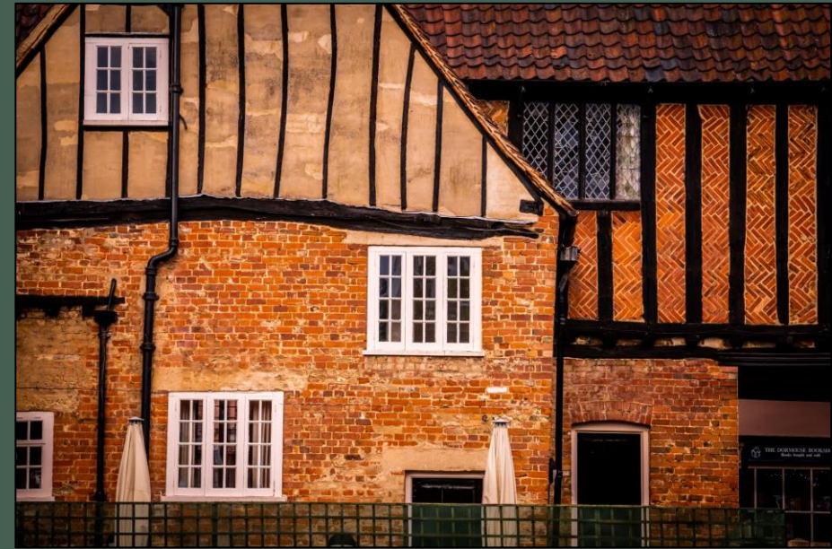
Elm Hill, Norwich