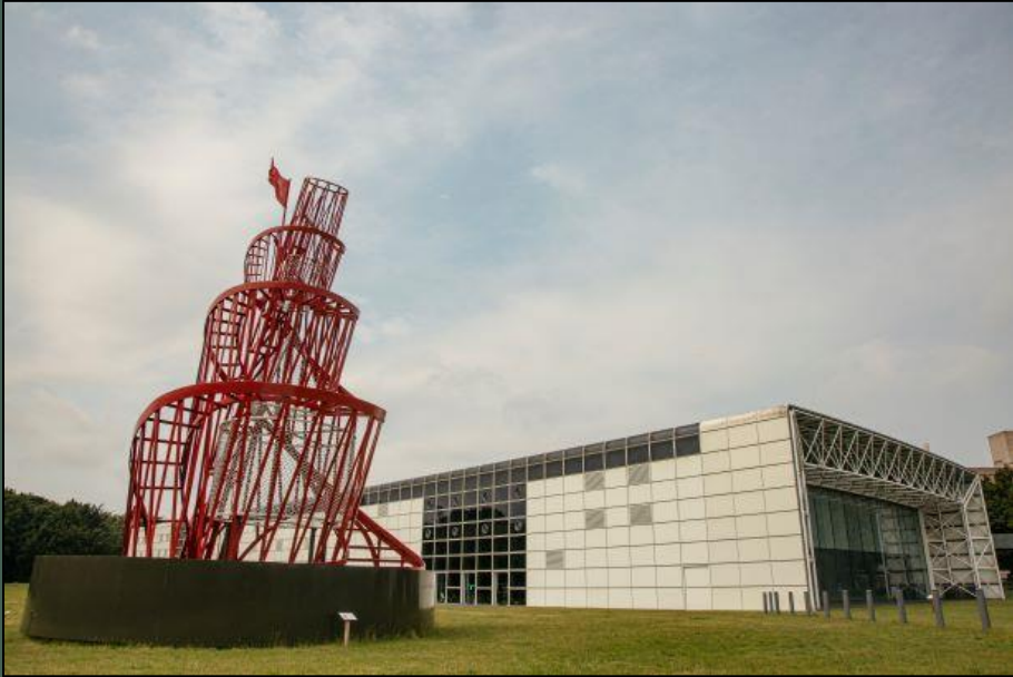
The Sainsbury Centre for Visual Arts