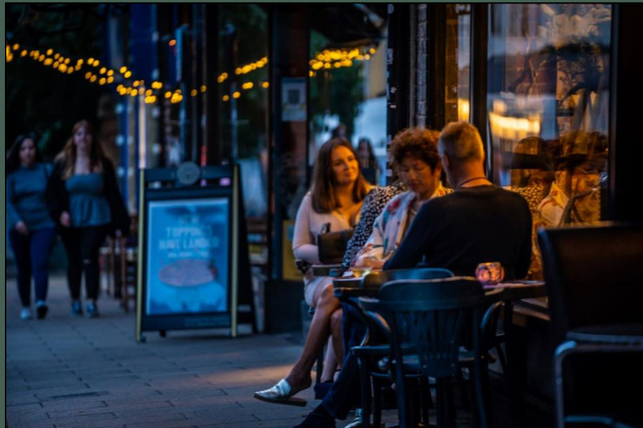
Dining in St Benedicts Street, Norwich Lanes