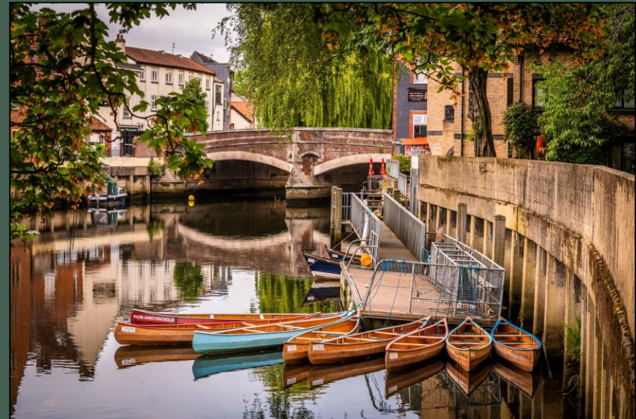
Fye Bridge, Norwich Cathedral Quarter