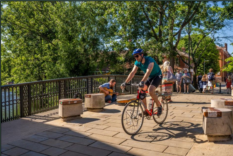
Norwich Creative Quarter