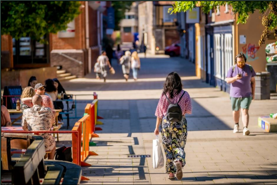
St George's Norwich City Centre