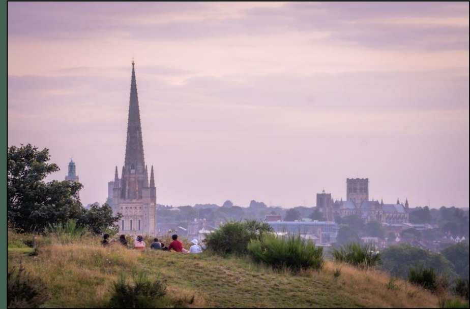
View of Norwich Cathedral from Mousehold Heath