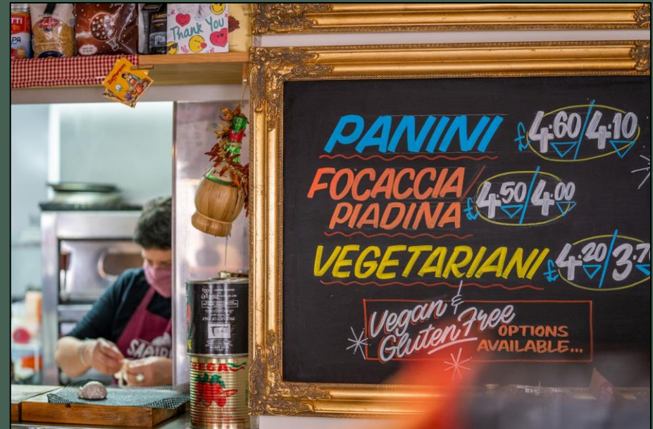
Saporita in The Norwich Lanes