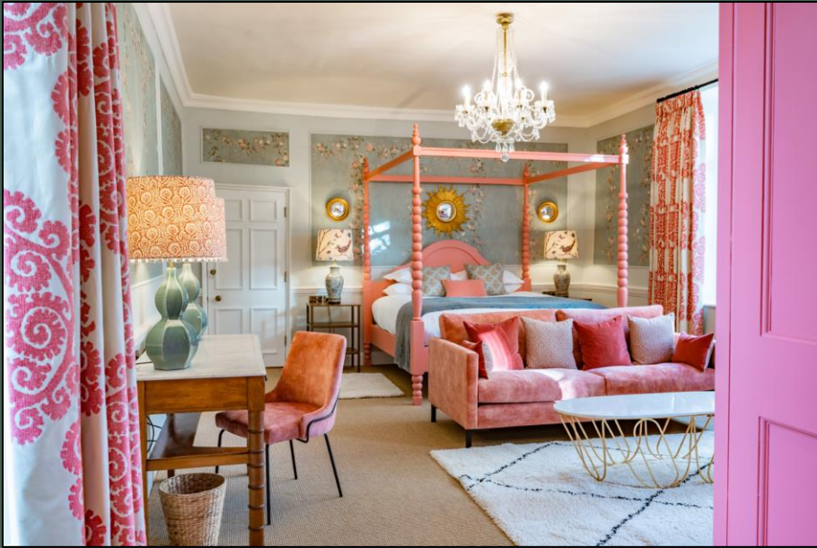
The Assembly House