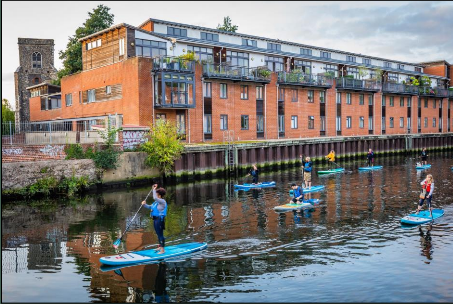
Canoeing on the river Wensum