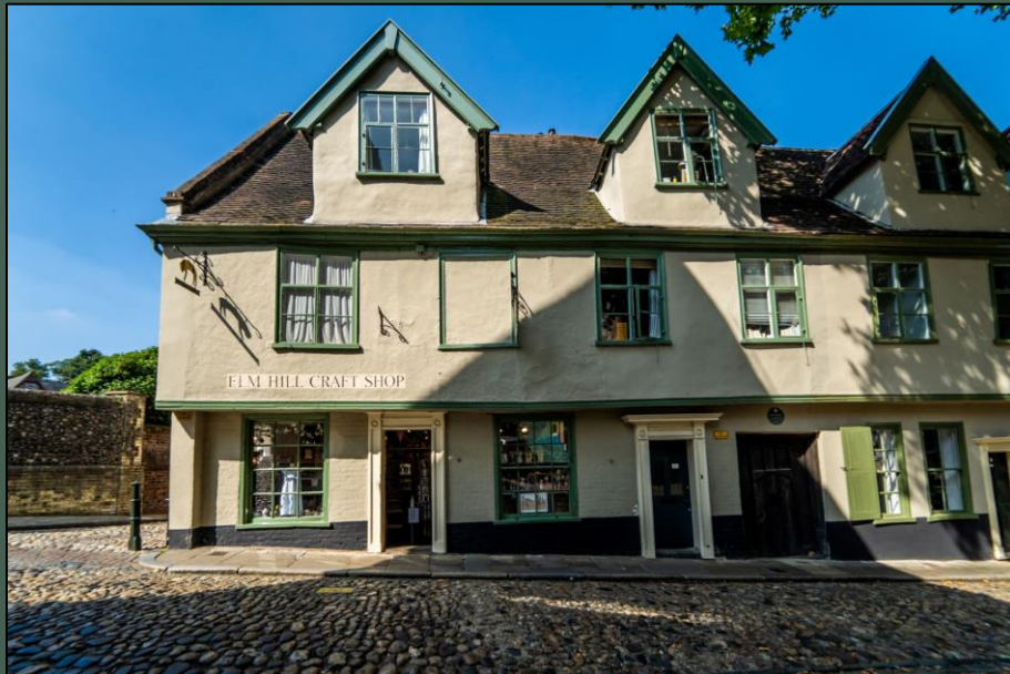
Elm Hill, Norwich's most complete medieval street