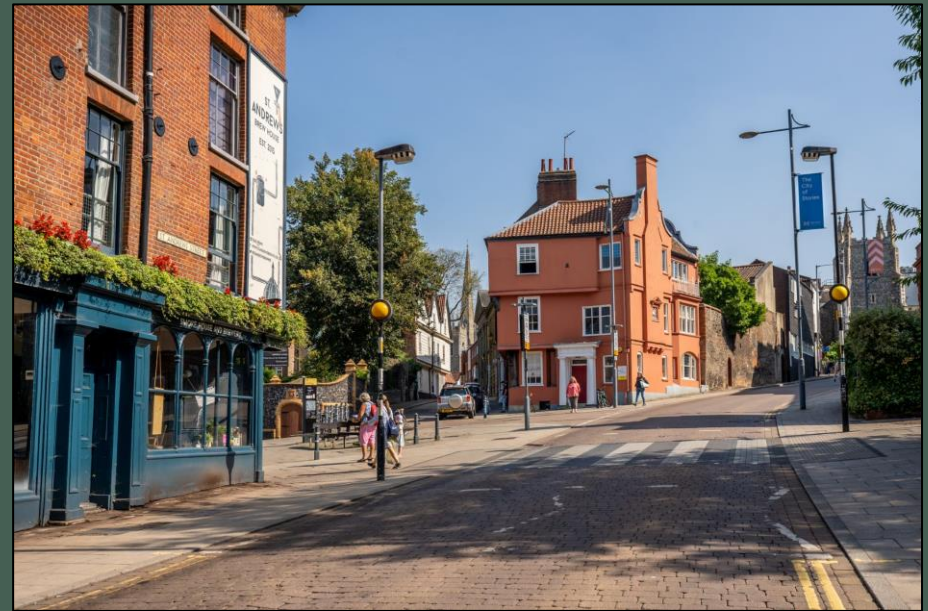
St Andrew's, Norwich City Centre