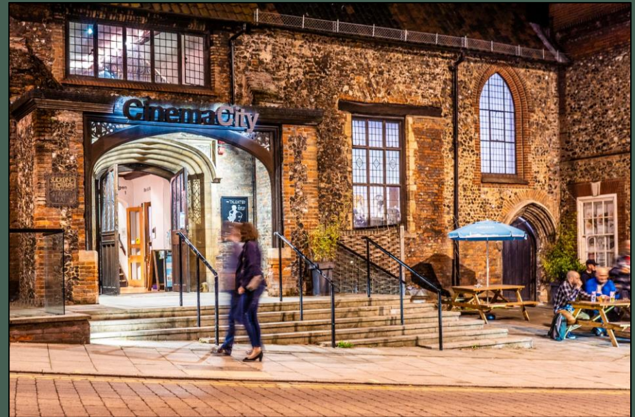
Norwich's Creative Quarter