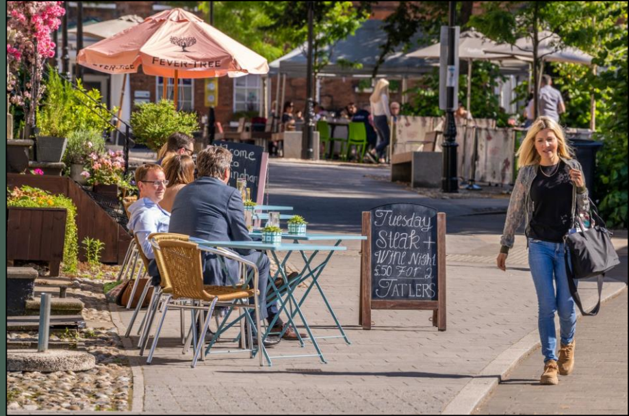
Norwich Cathedral Quarter