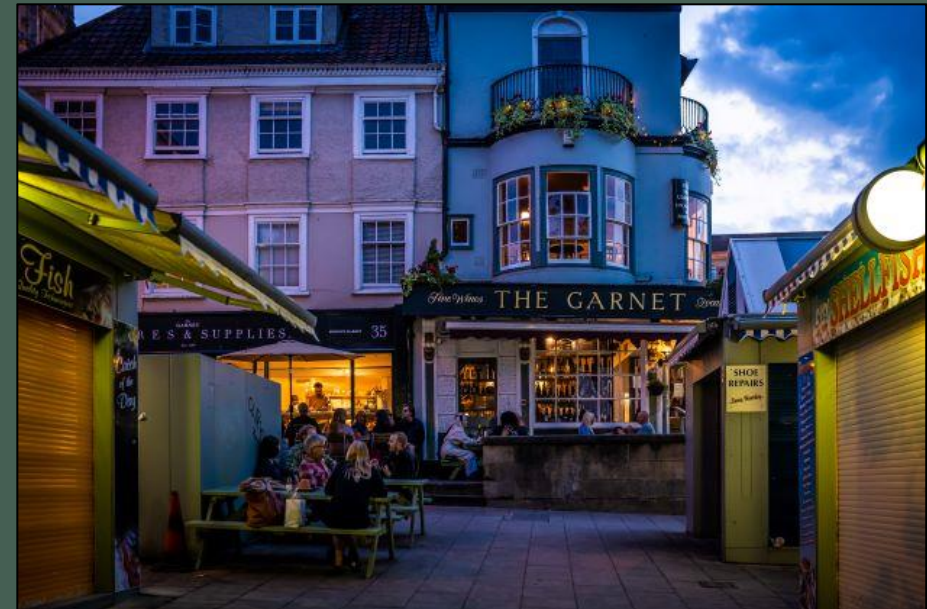
Norwich Market at Night