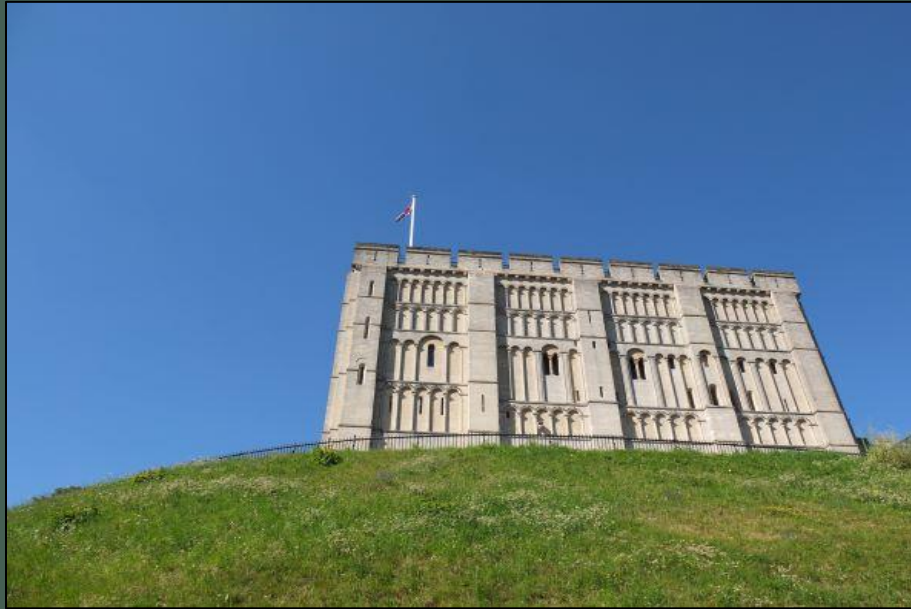
Norwich Castle Museum & Art Gallery