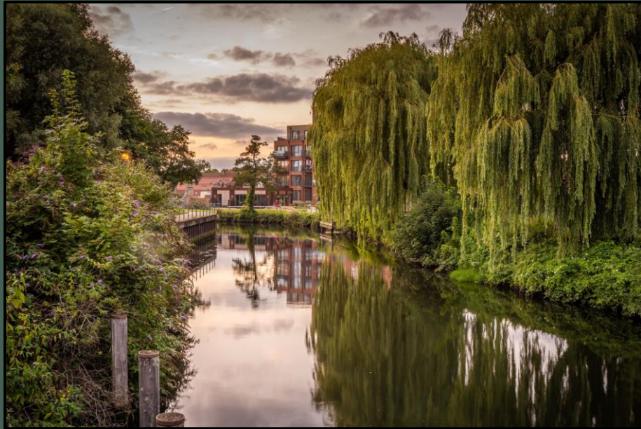
The river Wensum through Norwich