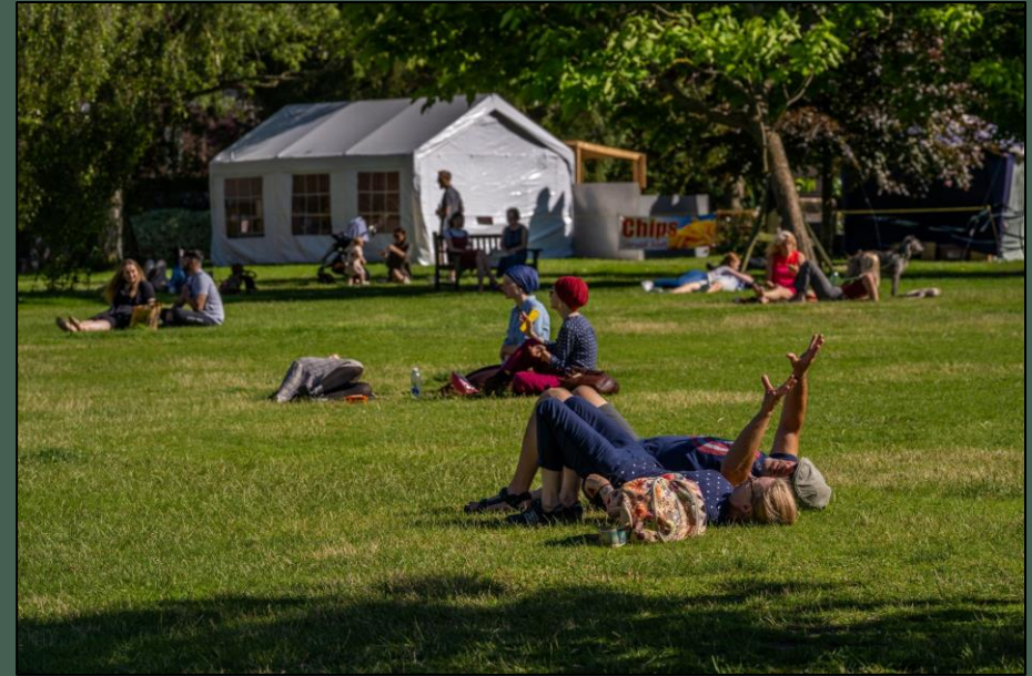
Relaxing in a park