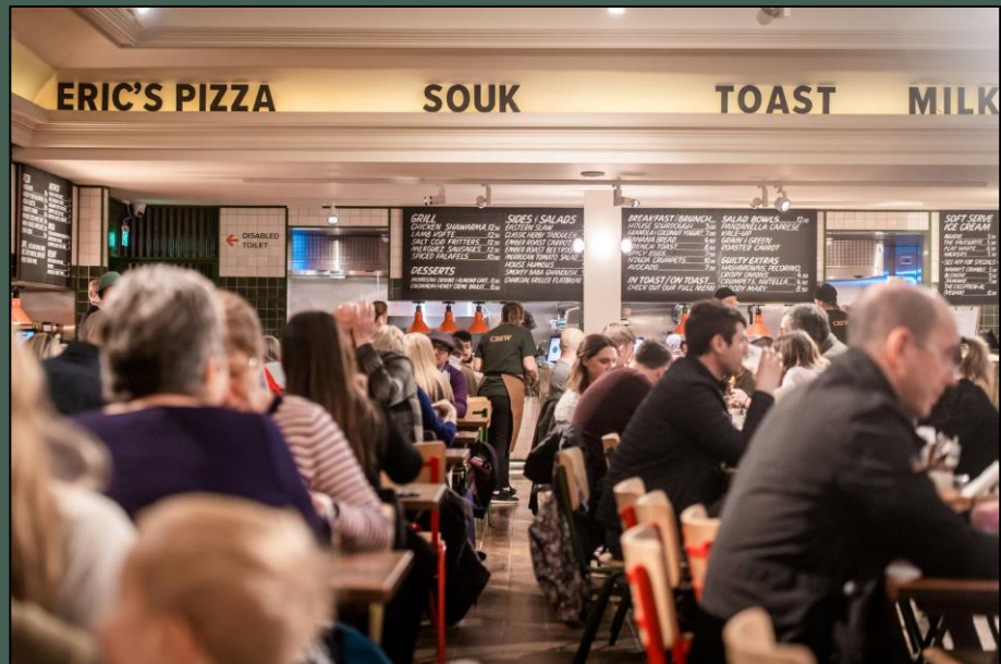
Yalm (food hall,) The Royal Arcade